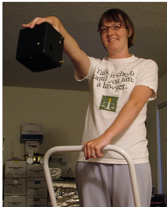
FIGURE 4-3. A BalloonSat being readied for its drop test.