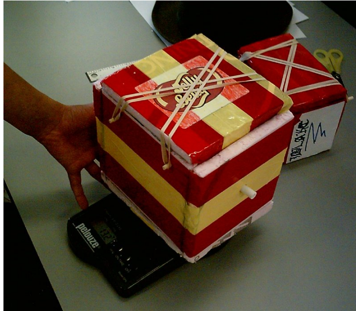
FIGURE 4-1. A middle school student weighing his BalloonSat.

capable of carrying out the most science by developing a scoring system that grants higher scores to lower weights.