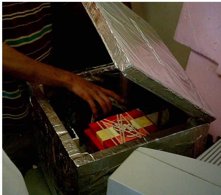
FIGURE 4-2. Loading a BalloonSat into a thermal test chamber.

A thermal test requires a thermal test chamber. Therefore, construct the thermal test chamber (TTC) as explained in Appendix A.