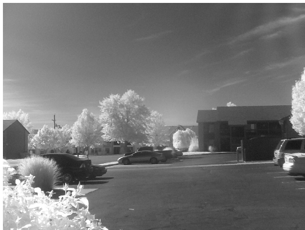
Figure 2. Example of a NIR image taken by the modified BalloonSat camera. The camera was set to record black and white images.

The BalloonSat kit comes with a polarizing filter and four theater gels (blue and red). The polarizing filter can be placed over the camera lens to detect the presence of polarized light in near space. When the theater gels are stacked up, they block visible light and only let near infrared light (NIR) enter the camera. According to the camera, the intensity of NIR is not as great as visible light. Therefore, the camera shutter must stay open longer. The BalloonSat will spin and swing during its mission. You can help dampen out this motion by adding two long dowels to the BalloonSat. If the dowels stick out a few feet from the BalloonSat, their inertia will make it more difficult for your BalloonSat to swing around. You might even try adding light weights to the end of the dowels. But remember, your BalloonSat can't weight more than a pound.